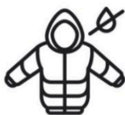
Water Resistant Clothing