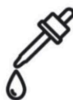
Stain Resistant Product