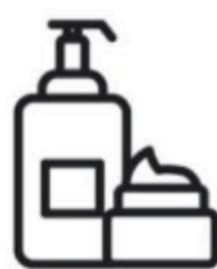
Personal Care Products