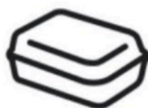
Fast Food Packaging